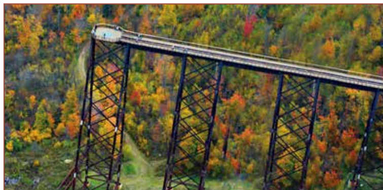
"One of the top 10 most scenic skywalks in the world," The Culture Trip, U.K.

Check into your lodging in Bradford, PA, which will become your center for adventure while touring the region.