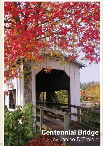
Centennial Bridge by Janice D’Emidio

Cottage Grove Covered Bridges – Spend the day escaping on a relaxing self-guided tour of historic covered bridges. Walk, drive or pedal through six of them in Cottage Grove. Known as the “Covered Bridge Capital of the West,” Cottage Grove’s covered bridge tour is accessible, well marked and slow-paced. The half-day drive begins in downtown Cottage Grove at the Centennial Bridge and follows the Row River Trail to Dorena Reservoir, then heads to the forested foothills. Changing leaves create a corridor of fall colors, perfect for a ride on the Covered Bridges Scenic Bikeway. The 36-mile paved route takes you by six covered bridges. You can even ride through the Mosby Bridge and Chambers Bridge which is the only covered railroad bridge west of the Mississippi.