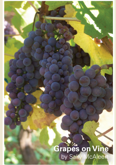
Grapes on Vine by Sally McAleen

overlooks more than one thousand acres of vineyards, orchards and gardens. Wheelchair accessible walking tours of the wine production facilities are offered.