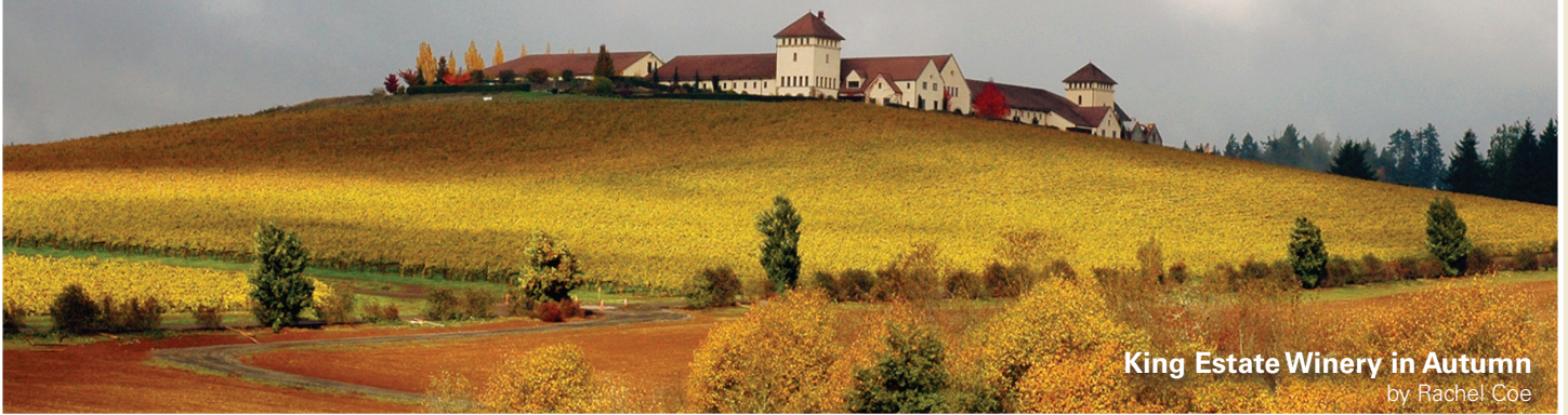
King Estate Winery in Autumn by Rachel Coe

Territorial Wine Trail – Oregon Wine Country comes alive in the fall. The grape leaves turn vibrant oranges and yellows. More than a dozen award-winning wineries grace Territorial Highway, a scenic and verdant 40-mile stretch from just north of Eugene to Cottage Grove. Start by sipping from tasting room to tasting room, take a Pinot Clinic at Pfeiffer Vineyards and have a picnic overlooking the foothills of the Coast Range at Sweet Cheeks Winery. Finish the day at King Estate, Oregon's largest winery. Known for its pinot gris and farm-to-table restaurant, King Estate