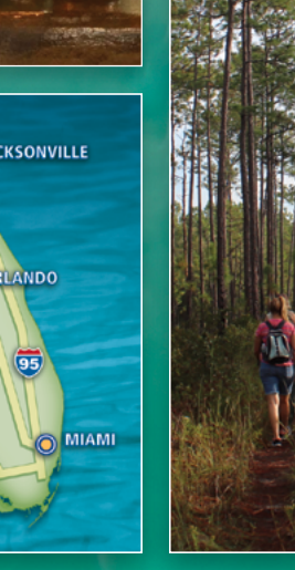
Take a hike or fly thru the treetops!